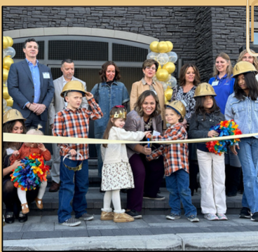
Purchased Our Forever Home