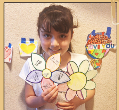
Began Angel Sibs - Grief Support Program

2024 was a transformational year for Candlelighters. We proudly purchased our building, securing a forever home for the families we serve. This new space allows us to expand programming and foster social connection and peer support—major levers to improving health outcomes for every member of the family.