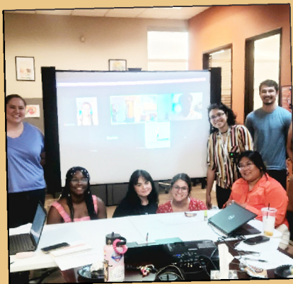
Launched Young Adult Advisory Council